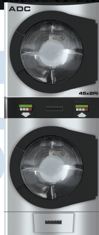
AD-45x2Ri OPL Dryer