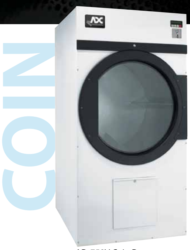
AD-758V Coin Dryer