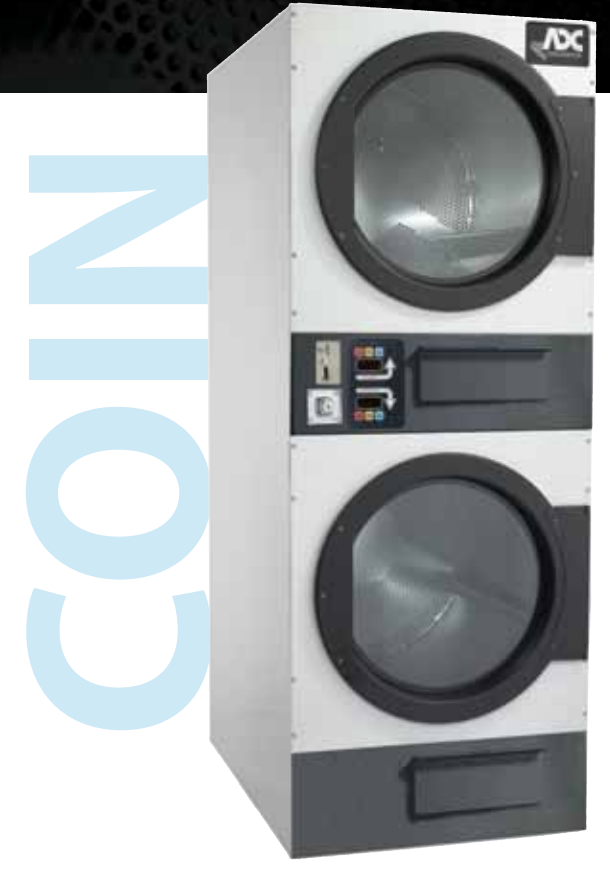
AD-333 Coin Stack Dryer