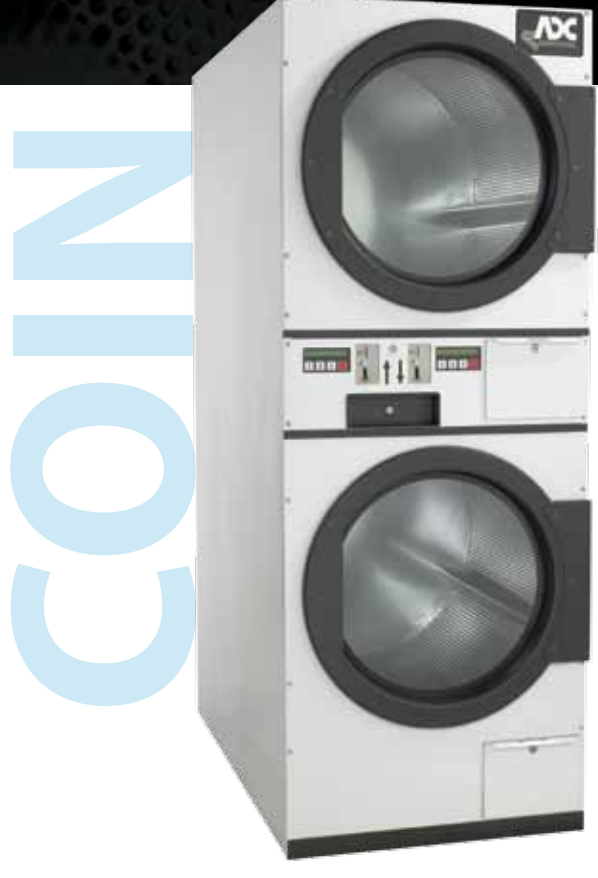
AD-236 Coin Stack Dryer