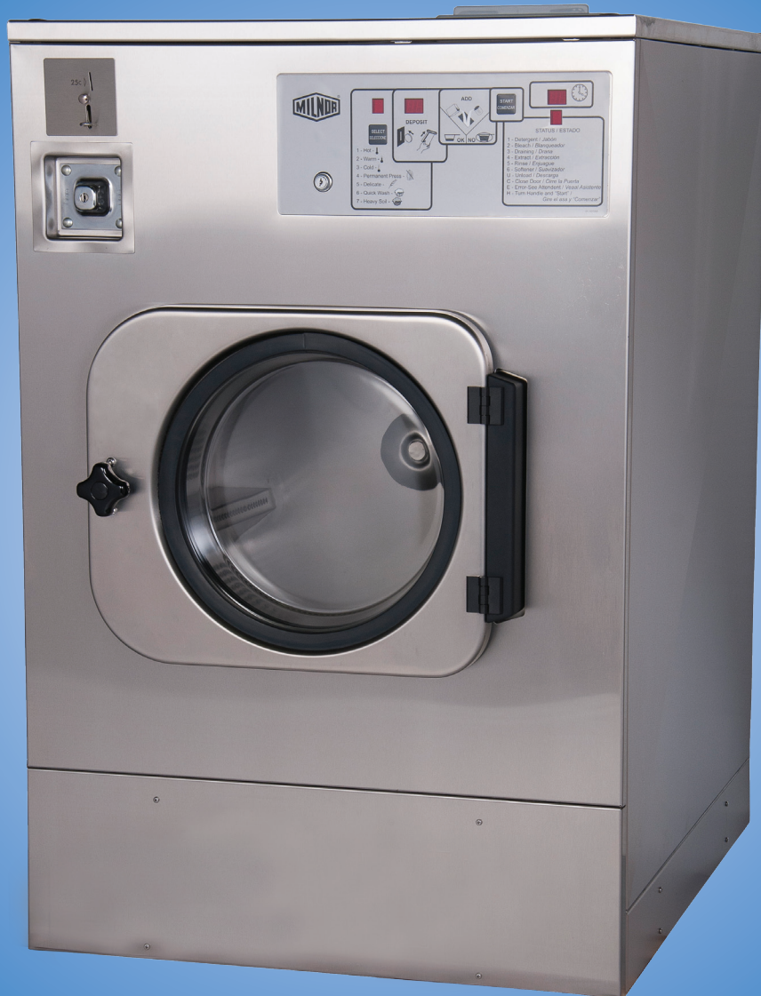
45 lb. capacity model MCR18E4

QUALITY, VALUE, DURABILITY ■ FOUR CAPACITIES ■ EASY-TO-USE CONTROLS