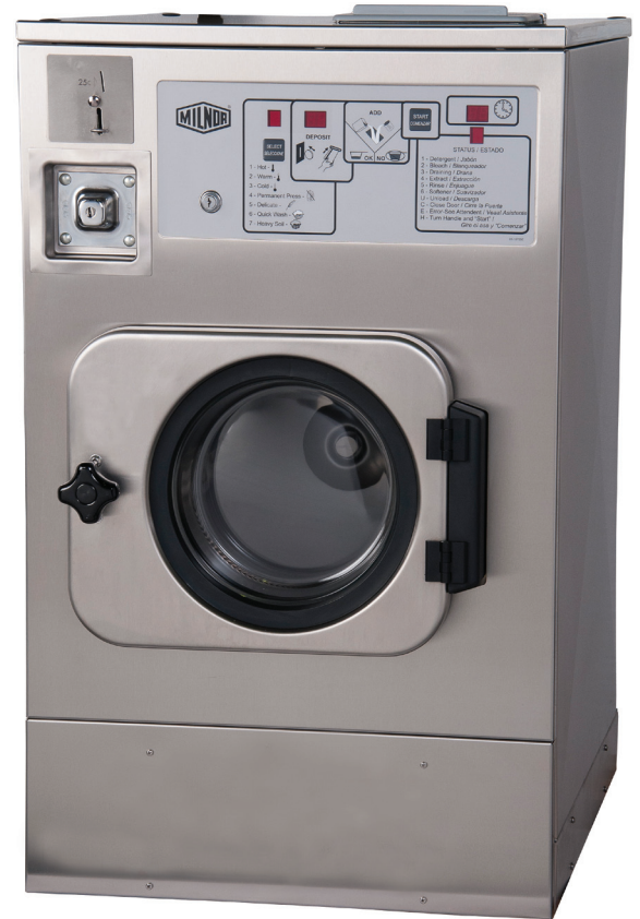
20-25 lb. capacity model MCR12E5

Ideal for unattended areas. Made of heavy gauge steel, the optional vault holds about $100 in quarters. All wash formulas have different vend prices and are completely programmable.